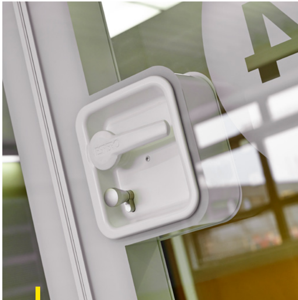
Houthaven Community School - Amsterdam, detail of the Visio 100.