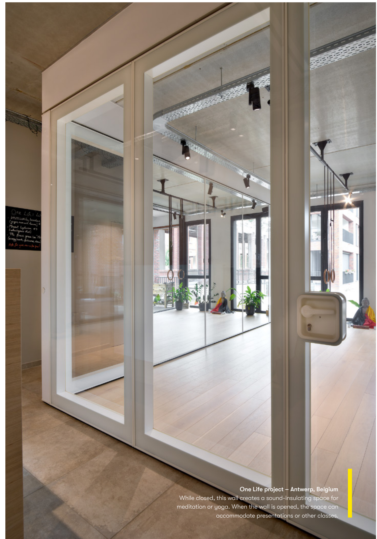
One Life project – Antwerp, Belgium

A wall that creates a sense of open space, while preserving privacy. This is thanks to the extending hermetic seals at the top and bottom of the panels, sound-insulating rubber seals along the sides, and the various glass thicknesses and compositions. It gives the Visio 100 wall a sound insulation rating (Rw) of between 42 dB and 50 dB.