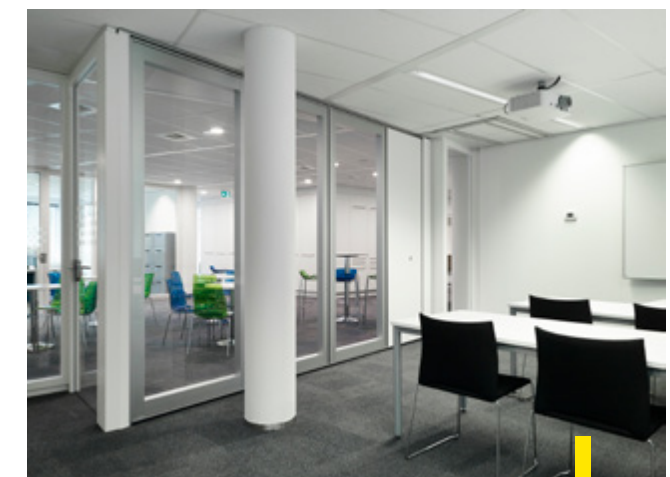
NEC - Hilversum A Visio 100 works particularly well in this bright space.